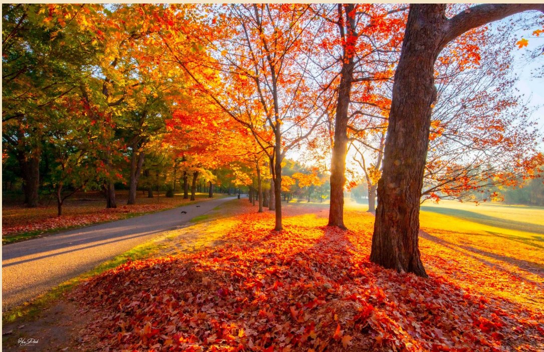
Photo of Rideau Hall Grounds in Ottawa

I hope this finds everyone well. We're experiencing more bizarre weather up here in Ottawa—not that I'm complaining about wearing shorts and basking in the October sun—who even knew there was such a thing? I imagine the golfers are reveling in this while the brows of skiers and other (clearly insane) winter outdoor enthusiasts are knitted in concern as they wonder ... will there be any snow at all between now and spring? Am I being a little overdramatic? Perhaps, but it's my job to be!